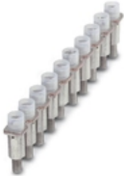
Fixed bridge, pitch: 8.2 mm, number of positions: 10, color: silver

Please be informed that the data shown in this PDF Document is generated from our Online Catalog. Please find the complete data in the user's documentation. Our General Terms of Use for Downloads are valid ( http://phoenixcontact.com/download )